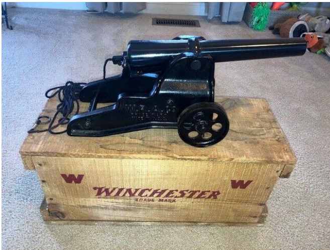
Winchester 10 gauge signal cannon